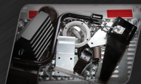
Truck & Trailer Parts & Accessories