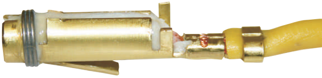
Heavy-duty brass with stainless compression ring