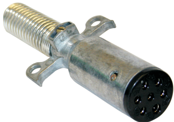
Reinforced Zinc die-cast

For new and innovative products, visit www.phillipsind.com L-APC 02-03-11